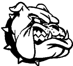
West Allis Central High School

West Allis Central High School Auditorium