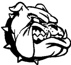
West Allis Central High School

West Allis Central High School Auditorium