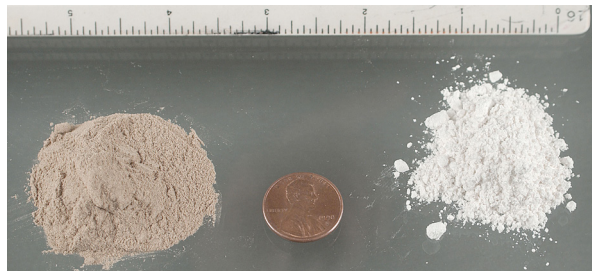
White to dark brown powder or tar-like substance